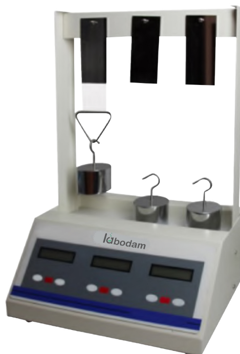
Lasting Adhesive Tester TLAT-A10