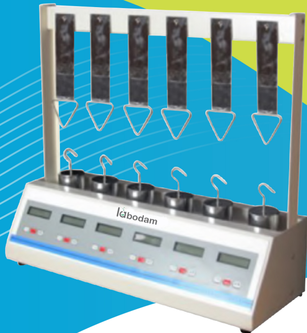
Lasting Adhesive Tester TLAT-A11