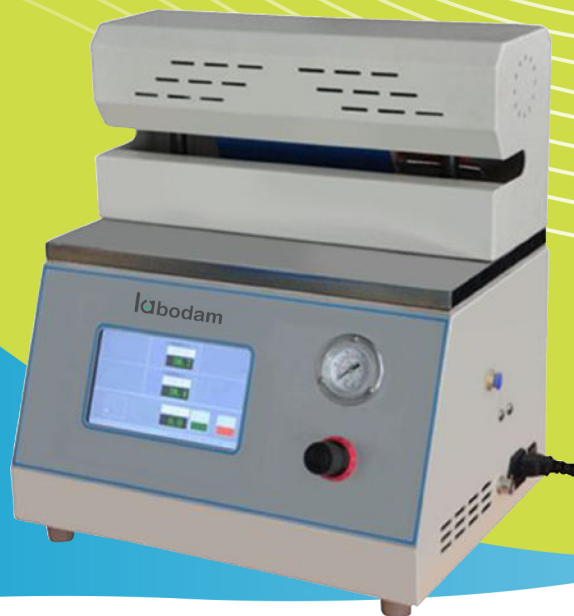
Heat Sealer THS-A10